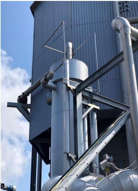
The water column with a newly built overfilling system

Milestone 3 (planned) : The plant supplies synthesis gas of approved quality to Höganäs with two bars of pressure without interruption for 168 hours (7 days)