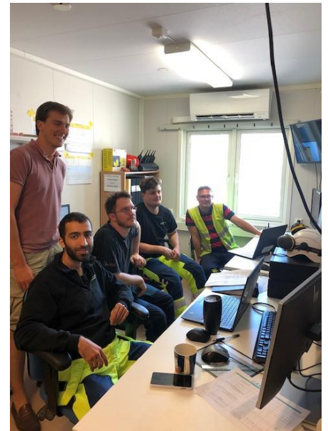
Cortus team in full activity during commissioning.